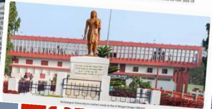
Berhampur University to conduct study on Bay of Bengal Odisha

Berhampur (Odisha), Dec 19 Odisha's Berhampur University (BU) on Tuesday said it has signed an MoU with an international think tank for collaborative research in the field of marine ecology and seeking to increase livelihood opportunities for the fisherfolk in the Bay of Bengal region.