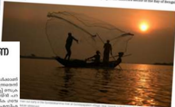
...the ... of ...

Climate change, marine pollution, overfishing, and oil spills plague the fisheries sector of the Bay of Bengal rim countries