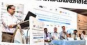
...the ... of ...

● സുസ്ഥിര വികസനത്തിനും അന്താരാഷ്ട്ര സഹകാരത്തിനും നന്ദം.