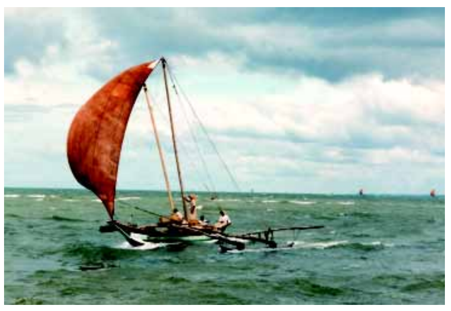
Oru, a traditional fishing craft of Sri Lanka.

Poor fishers and their dependents are not a homogenous, unchanging group of people. The level of absolute and relative poverty, within and between small-scale fishing communities, varies considerably by area, country, and region.