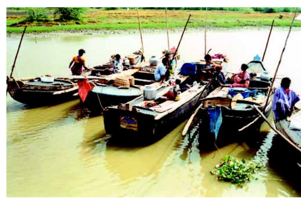
Shoe dhoni – a fishing boat of Andhra Pradesh that also serves as a home for the fisher family.

Solutions within the fisheries sector: As there is little scope for further expansion of capture fisheries given current levels of exploitation, it is crucial to manage fish resources to avoid further resource depletion. Effective and flexible management can improve incomes by limiting entry to the coastal fisheries, avoiding wasteful investments and over-capitalisation, and by supporting sustainable exploitation practices. It can also improve incomes for the poor by effectively protecting small-scale fishers from the activities of large-scale industrial fishing vessels, thereby