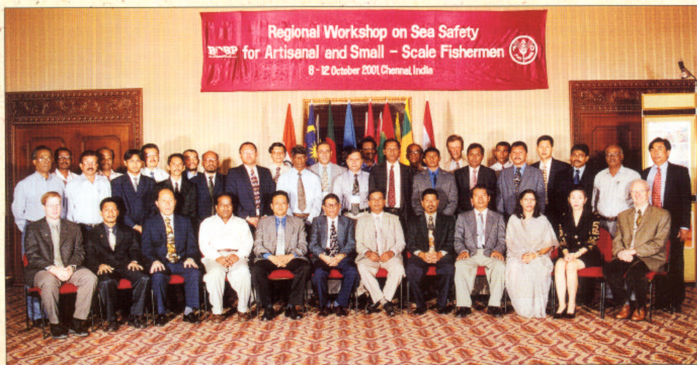
Delegates at the Regional Workshop on Sea Safety

Conscious that fishing is the world's most dangerous occupation with more than 24 000 deaths per year attributable to weaknesses in the institutional and regulatory environment, a declining resource base, and poor socio-economic conditions in the sector;